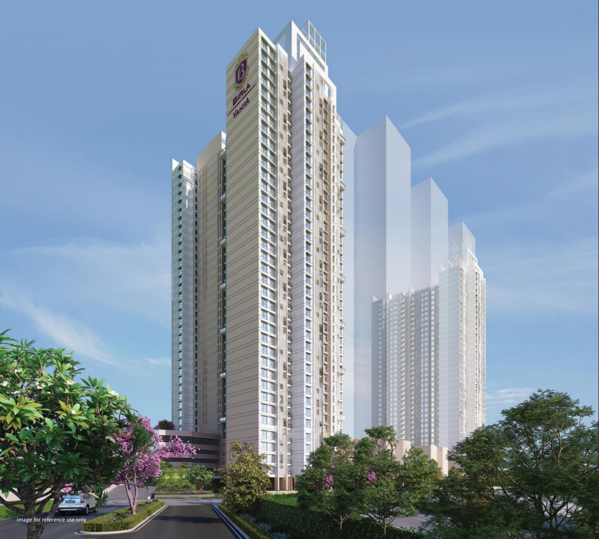
Image for reference use only