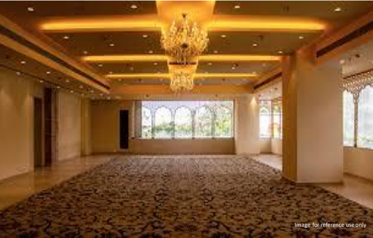
Image for reference use only